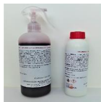
Cu-Au alloy Nps for professional surface decontamination