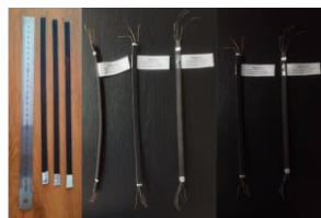
Heating cables with PTC effect